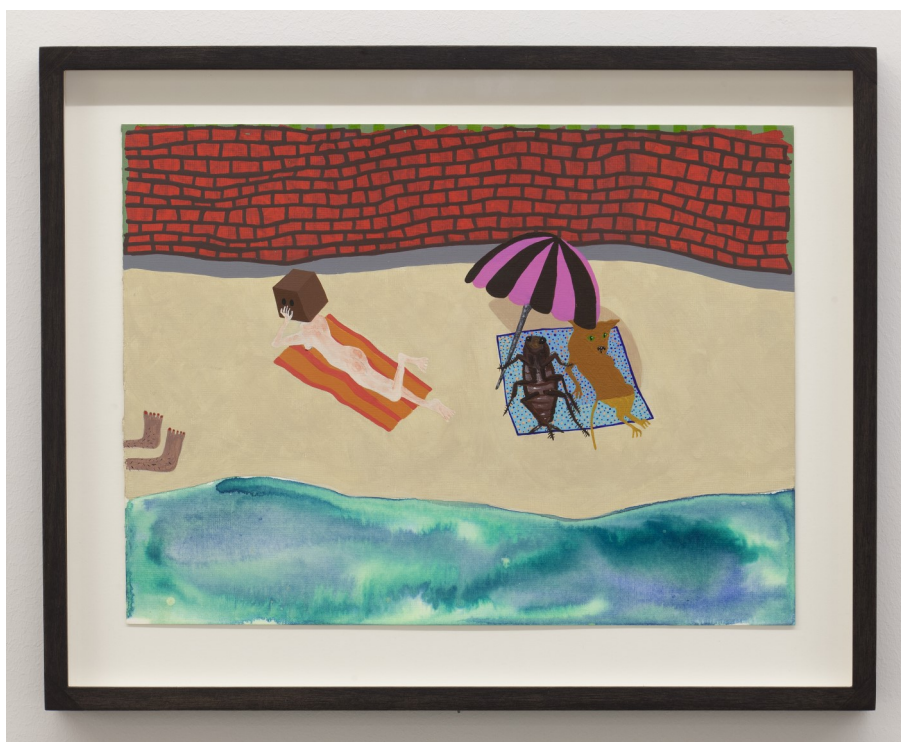
Padda á Ströndinni, 2020