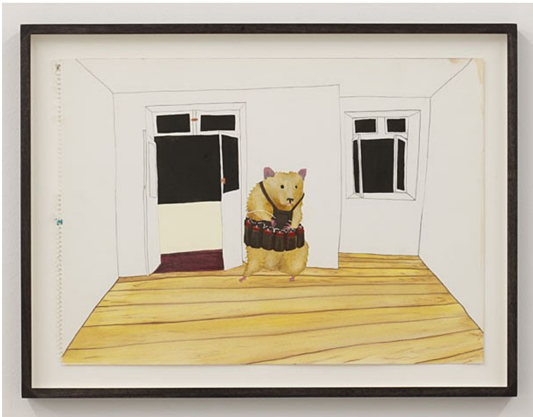
Hamster In Berlin Apartment 2018, 2018-2020