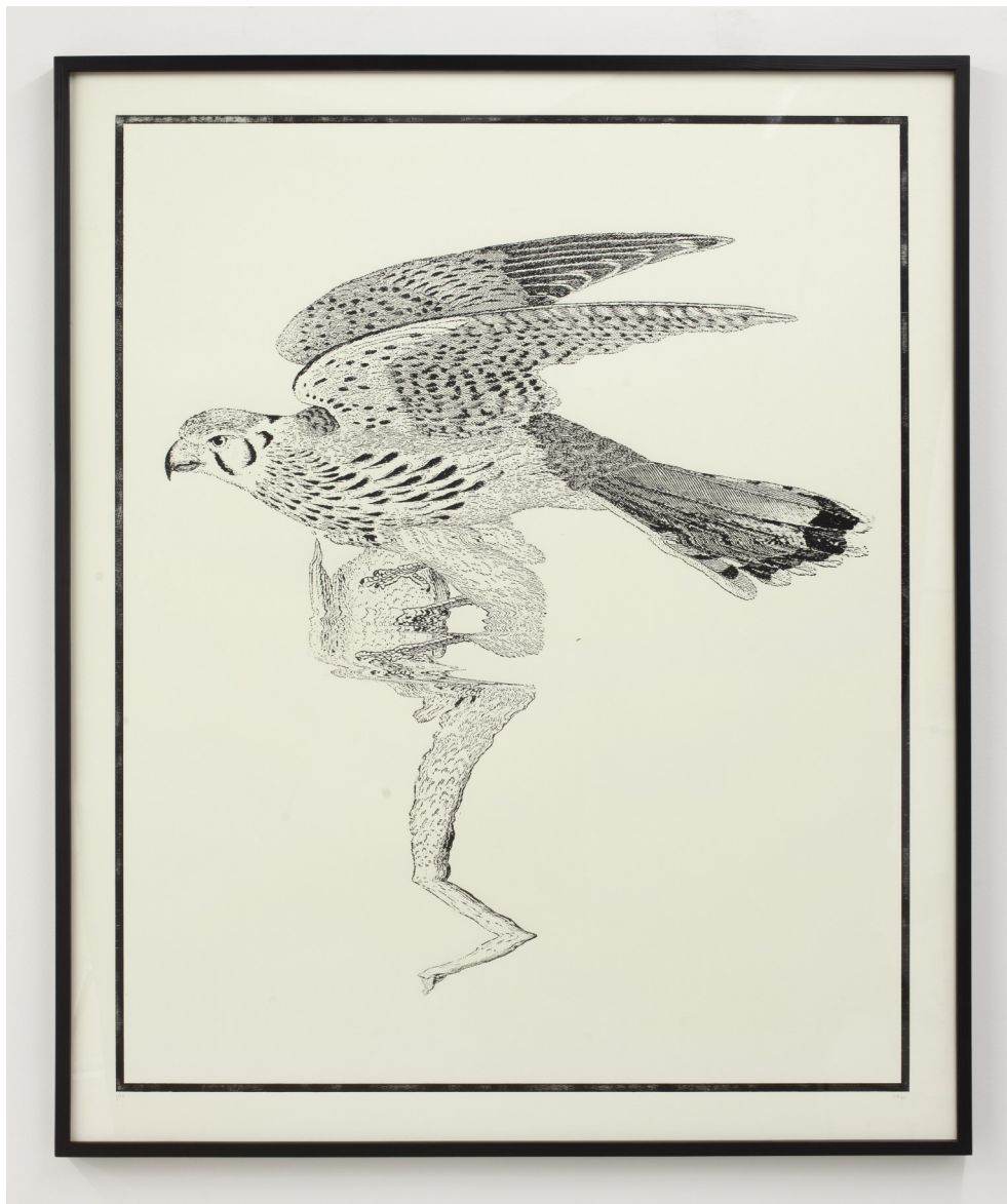
Absurd Sparrow- hawk, 2020