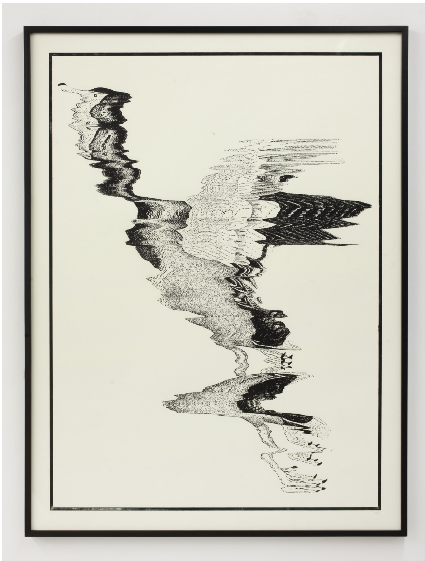
Absurd Mallard, 2020