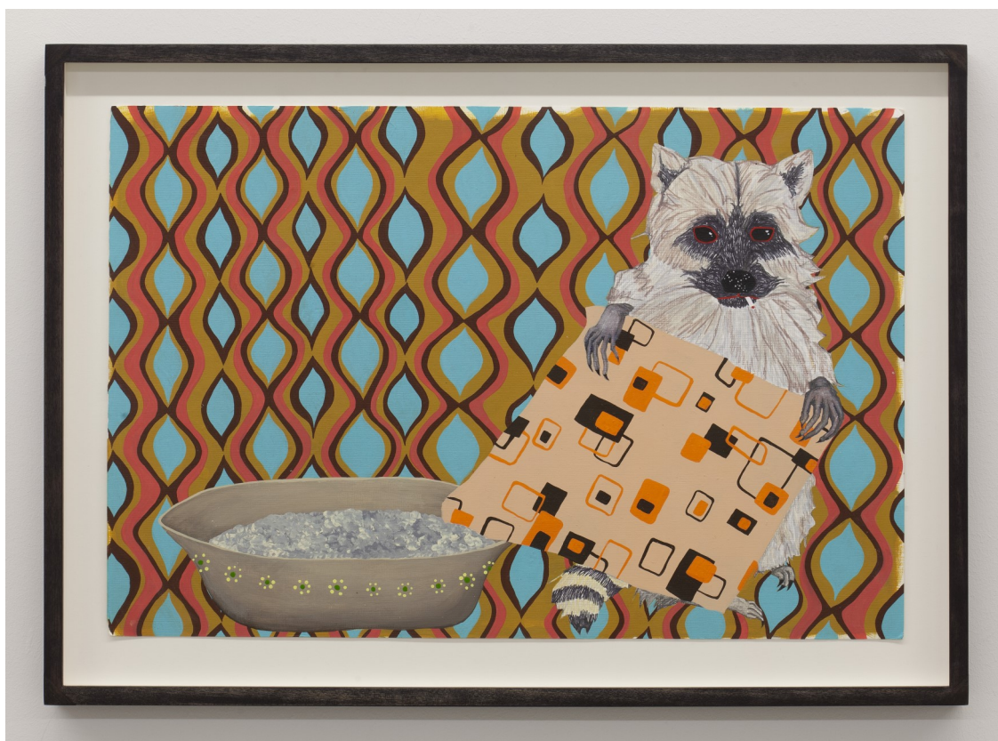
Laundry Bear , 2020