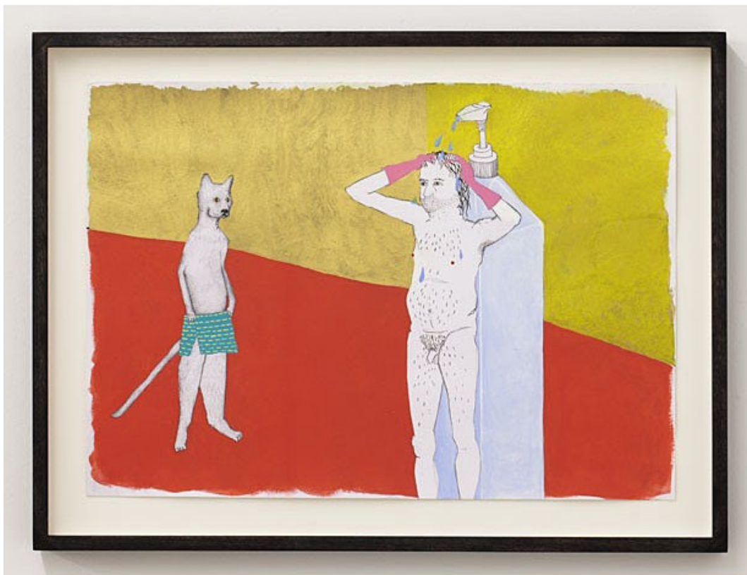
Man Showers With Cat, 2020