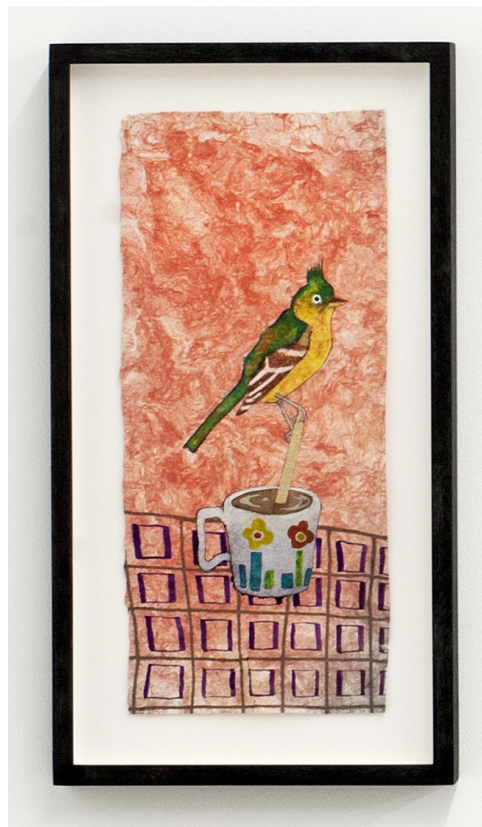
Untitled , 2018

Mixed media on handmade paper 31,4 x 13,8 cm