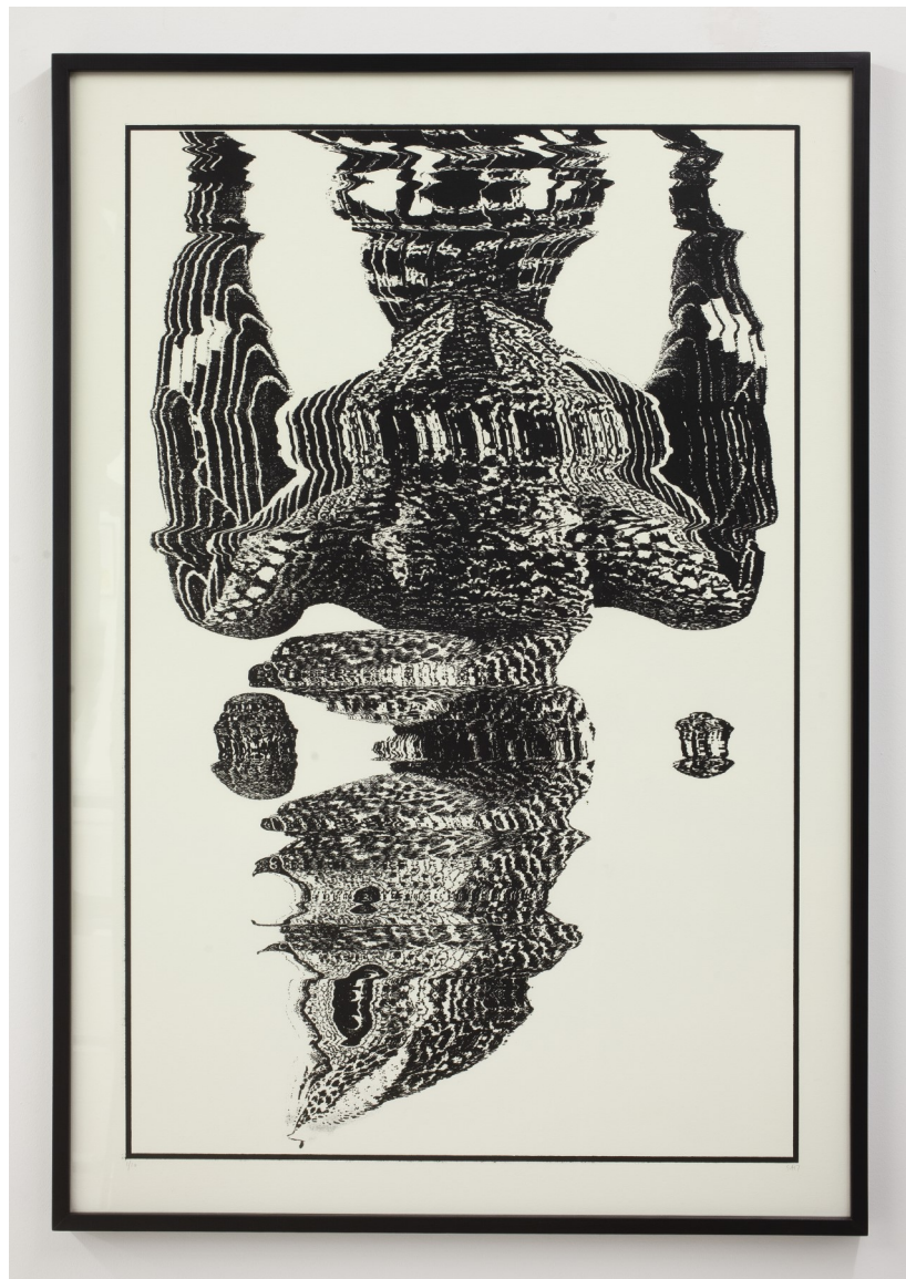
Absurd Night-hawk , 2017