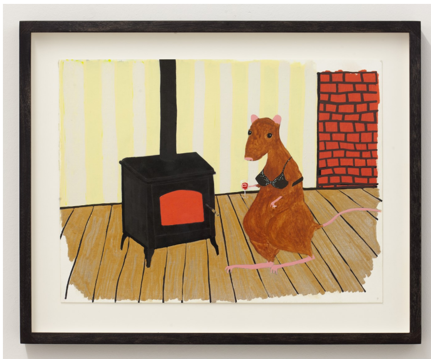
Winter in Normandie, 2020