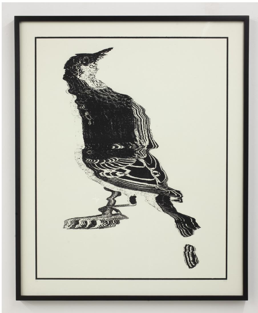
Absurd Autumnal Warbler, 2017