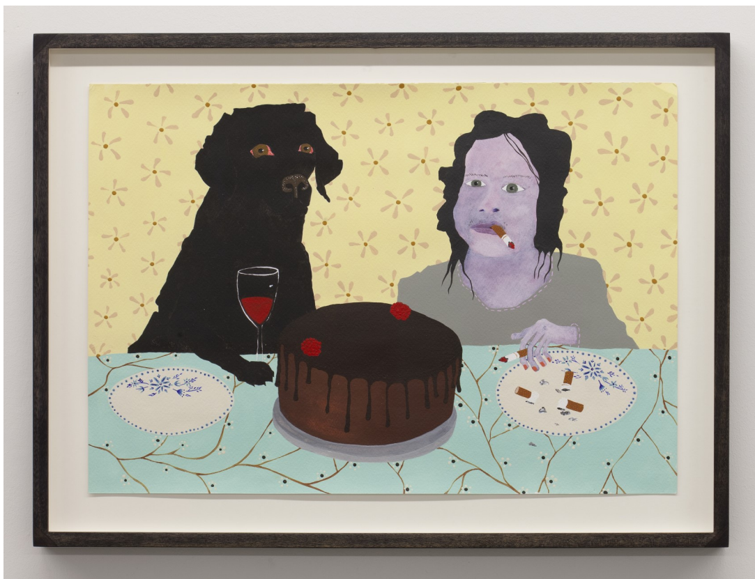
VIP Party, 2020