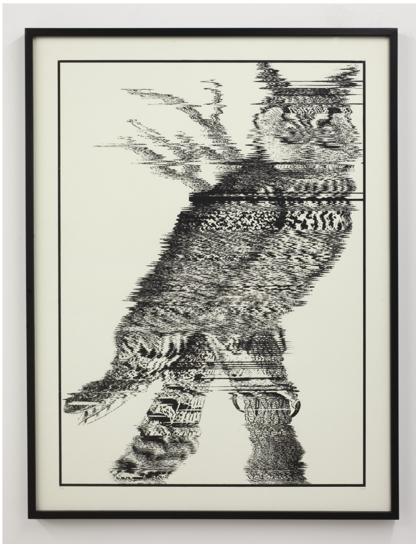
Absurd Long-eared Owl, 2017