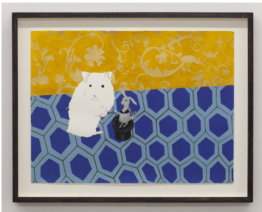
Simone and Top-hat, 2020