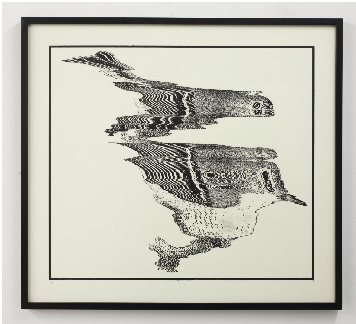
Absurd Ruby-crown'd Wren, 2017