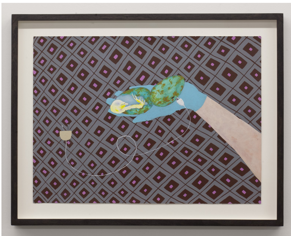
Baby Bird , 2020