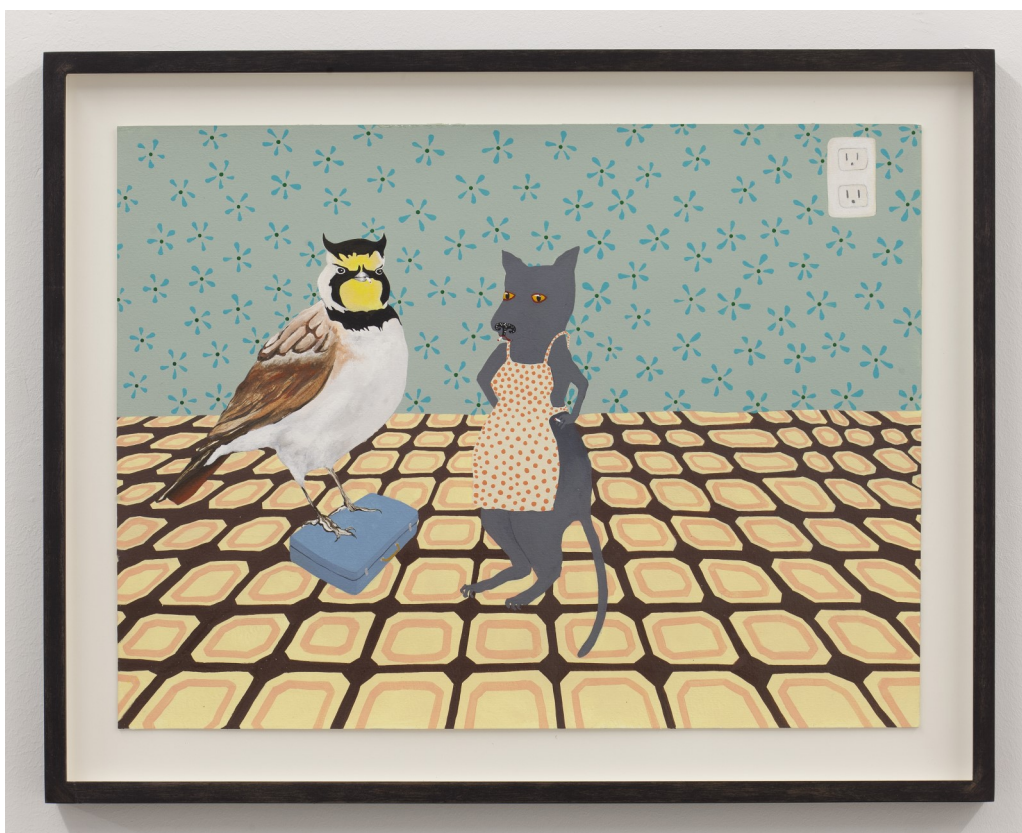
Cat, Bird and Suitcase, 2021