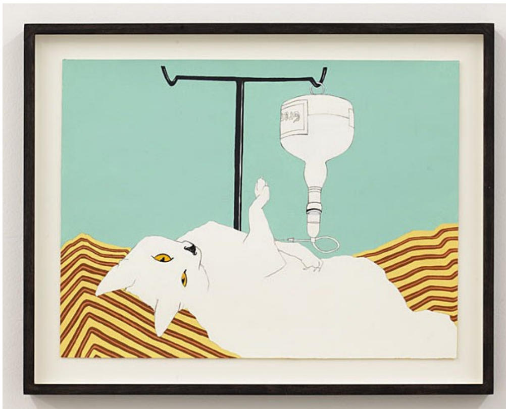
Thundershark With Gran Marnier IV, 2020