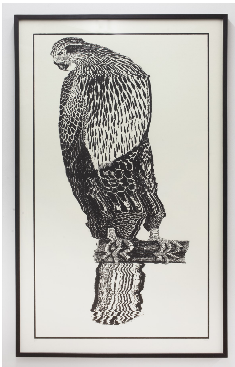
Absurd Sea-eagle, 2017