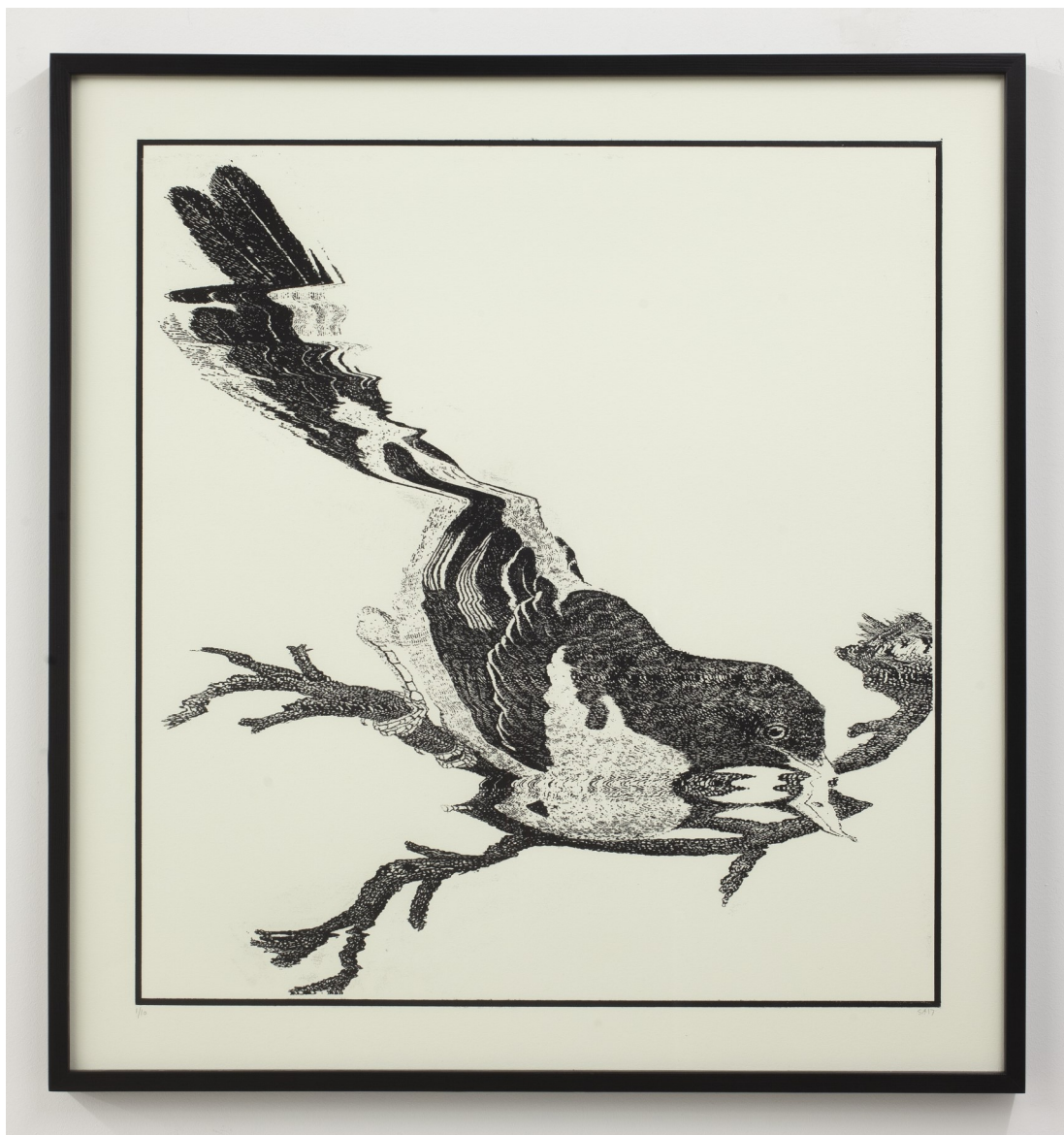
Absurd Baltimore Bird, 2017