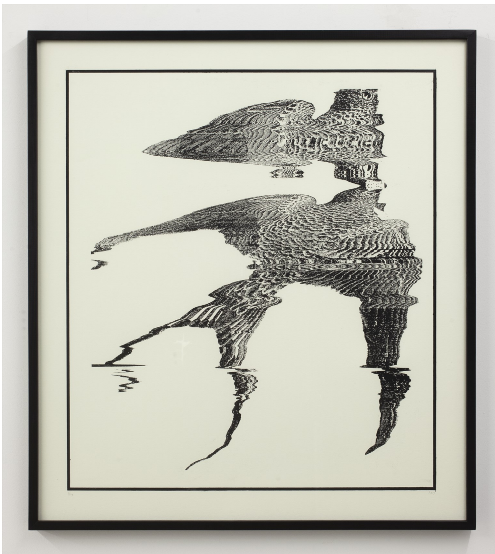
Absurd Barn Swallow , 2017