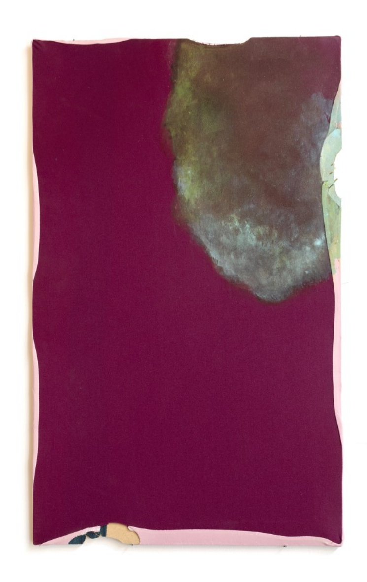
Small Landscapes, 2019 70 x 43 cm. Lycra, acryllic paint, mdf