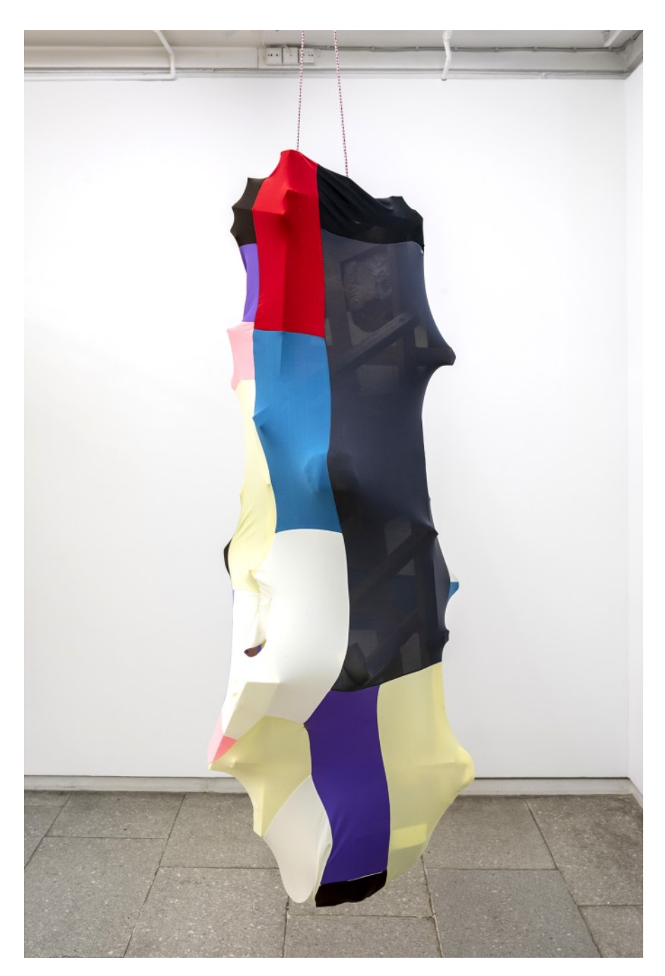
Double space, 2020 155 x 67 x 53 cm. Pine wood, lycra, rope