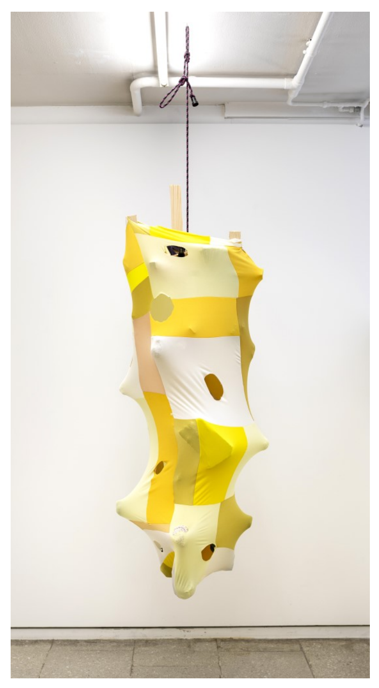
Double space - yellow , 2020 154 x 58 x 62 cm. Pine wood, fabric, lycra, string, foam