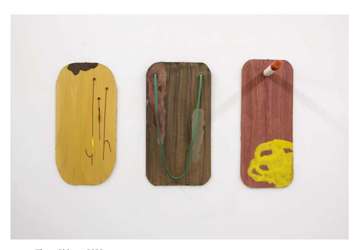
Three Objects, 2020

The Conception of a Different Landscape May 15 - June 27, 2020