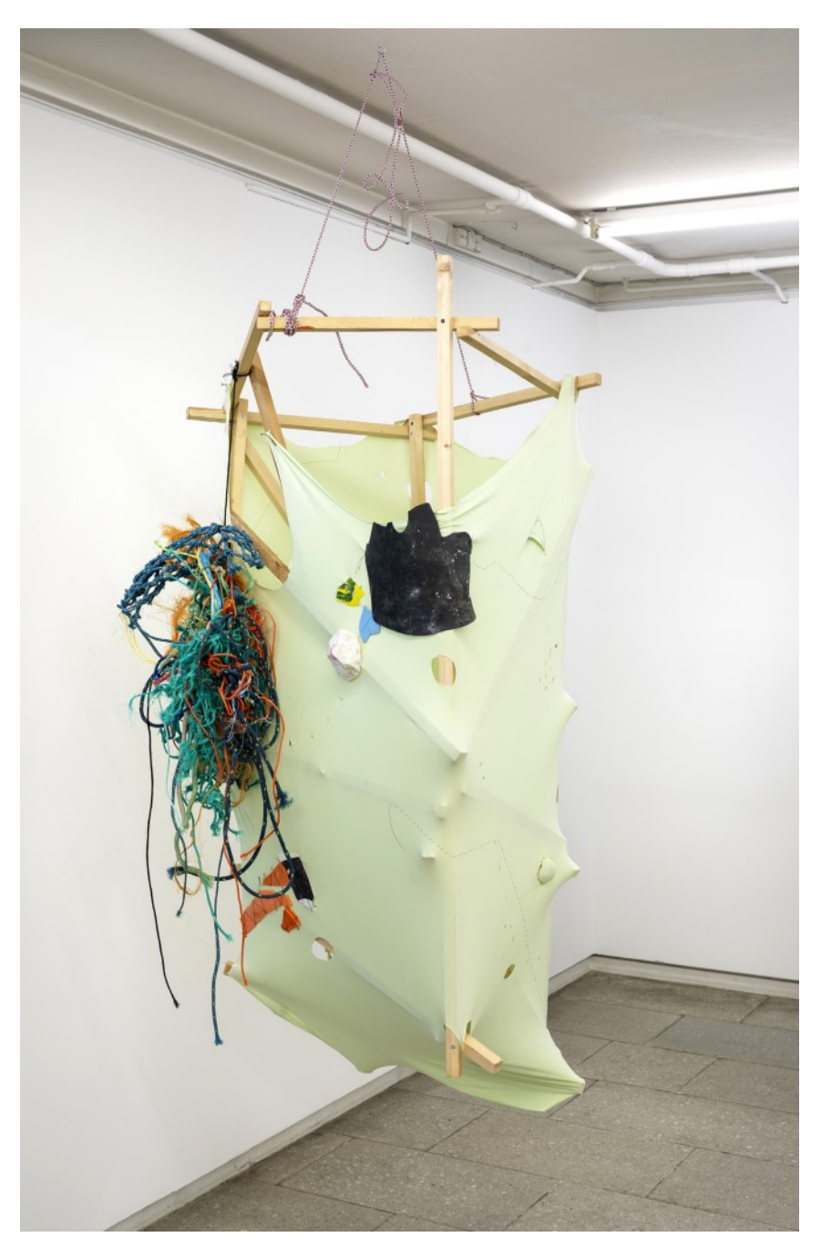
Landscape Fetich, 2020

The Conception of a Different Landscape May 15 - June 27, 2020