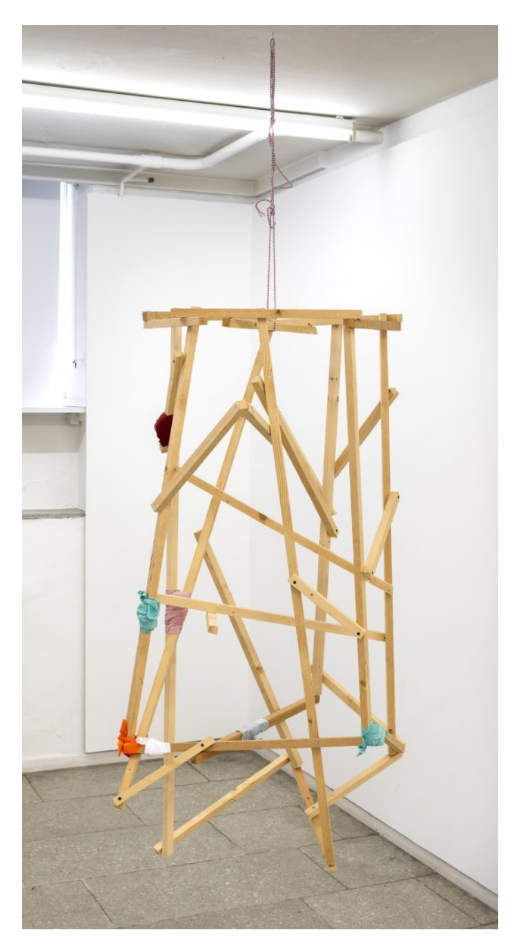
Seven Points in Open Surfaces , 2020 155 x 90 x 68 cm. Pine wood, lycra, rope