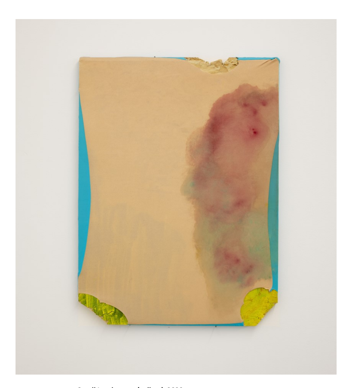
Small Landscapes (yellow), 2020 59,5 x 44 cm. OSB slate, acrylic paint, lycra