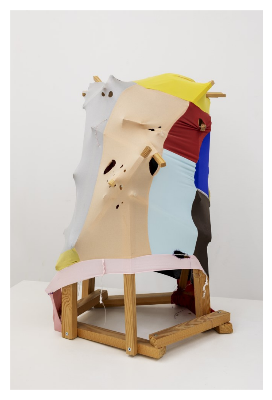
Untitled (small, standing), 2020 65,5 x 46 x 48 cm. Lycra, pine wood