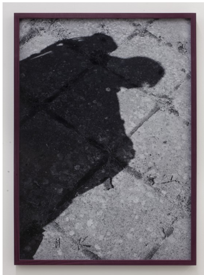
Portrait of a Professor of Fine Arts, 2020 (Stig Brøgger) glicée print on Hahnemühle Pearl paper 75 x 60 cm ed. 2 + 1 AP