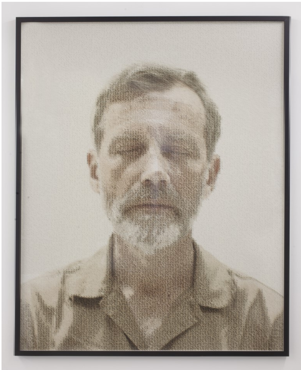
Portrait of a Museum Director, 2020 (Mikkel Bogh) giclée print on Hahnemühle Pearl paper 125 x 100 cm + frame ed. 2 + 1 AP