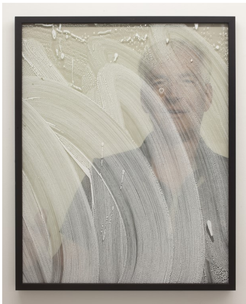
Portrait of a Window Cleaner, 2020