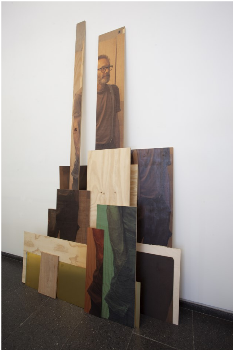
Portrait of a Craftsman, 2020 (Frank Hautau) acrylic and UV-print on birch veneer 266 x 154 cm ed. 2 + 1 AP