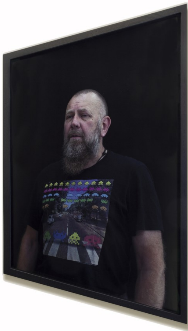
Portrait of a Framer, 2020 (Klaus Gråe) giclée print on Hahnemühle Pearl paper 90 x 50 cm + frame ed. 2 + 1 AP