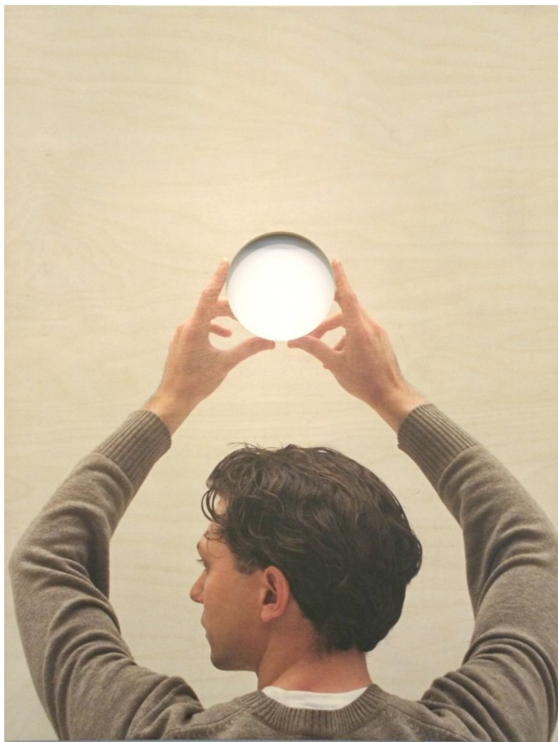
Portrait of an Assistant, 2020 (Gustav Holst Kurtzweil) UV-print on birch veneer 85 x 65 cm ed. 2 + 1 AP