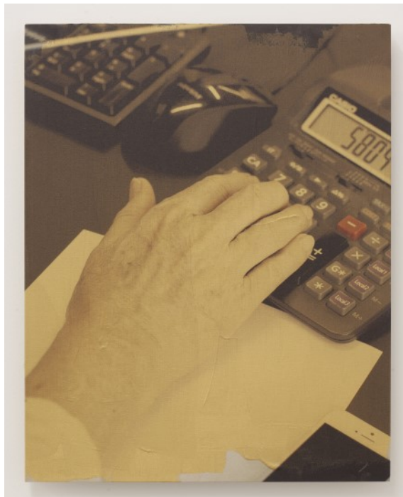
Portrait of an Accountant, 2020 (Kim Lauge) acylic and UV-print on birch veneer 50 x 40 cm ed. 2 + 1 AP