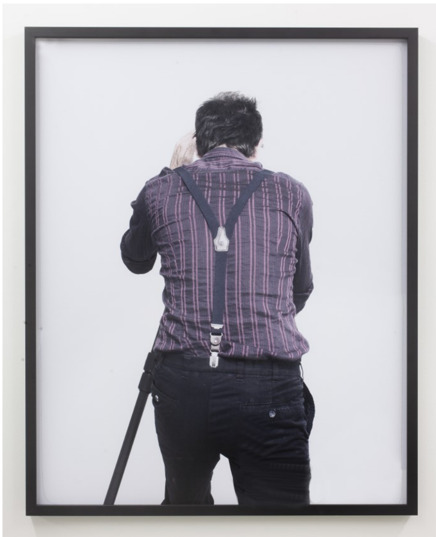
Portrait of a Photographer, 2020 (Anders Sune Berg) giclée print on Hahnemühle Pearl paper 87,5 x 70 cm ed. 2 + 1 AP