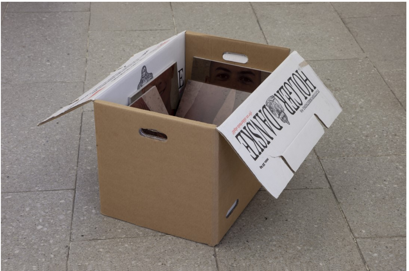
Portrait of a Courier, 2020 (Stefan Obradovic) UV-print on limestone, cardboard box 40 x 58 x 83 cm ed. 2 + 1 AP